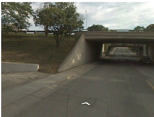
Figure 2: Grade Separation (shows the elevation view of the grade separation between these two roadways)