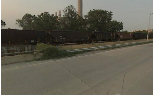
Figure 3: Potential Station Location 2 (elevation view of the potential bus location and the limited space that is available between the existing railroad and Campus Dr.)